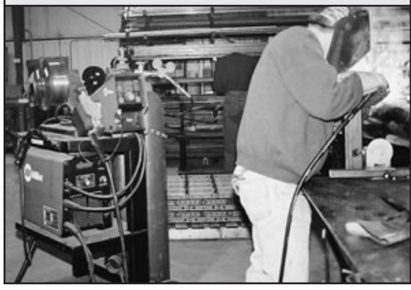
"The ability of the XMT 350 to ride through the voltage drop that shut down (other inverters) was proof positive to me of Auto-Line's benefits," says the owner of this fab shop.

Auto-Line can assist in maintaining weld specifications and deliver uninterrupted production.