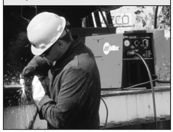
The Spectrum 2050, the first inverter ever to feature Auto-Line, gained the respect of contractors for its ability to work wherever they do.

With a Miller inverter featuring Auto-Line, simply connect the right plug and you're ready to weld or cut anywhere in the world.